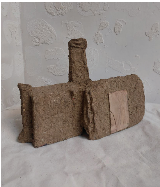
That Home Papier-mâché 20x20x30cm