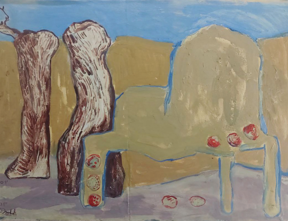
Semnan's Bones Mixed Media 50x70cm