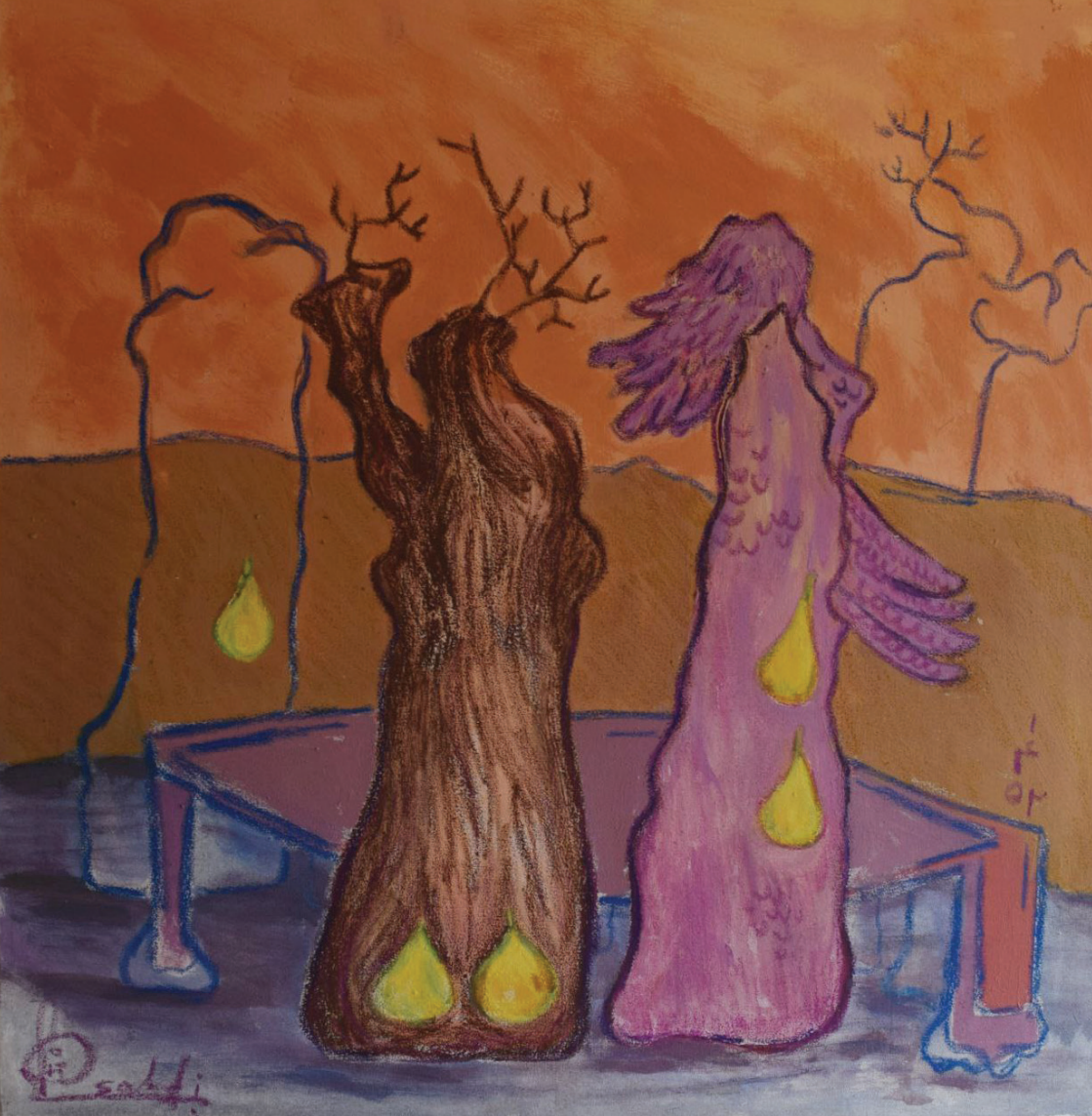
The Spirit Of The Tree Mixed Media 60x60cm