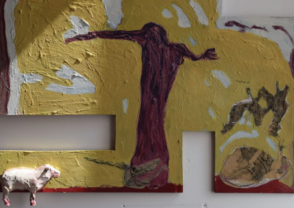
Untitled Mixed Media 50x70cm