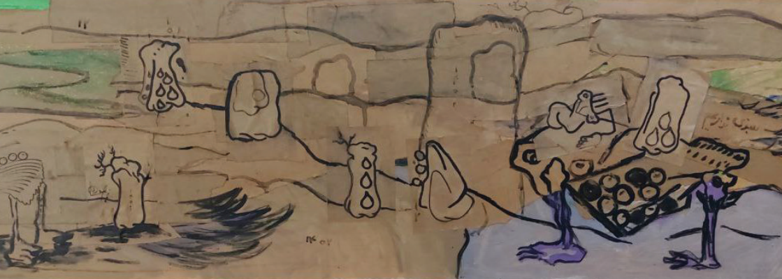
Between Two Alleys Mixed Media 90x30cm