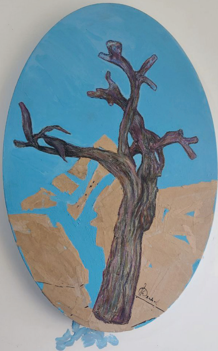
Friend Mixed Media 60x30cm