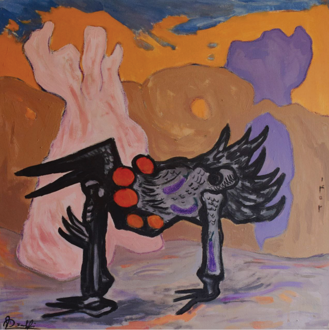
The Crow Stole Semnan Eggplants And Tomatoes From The Garden