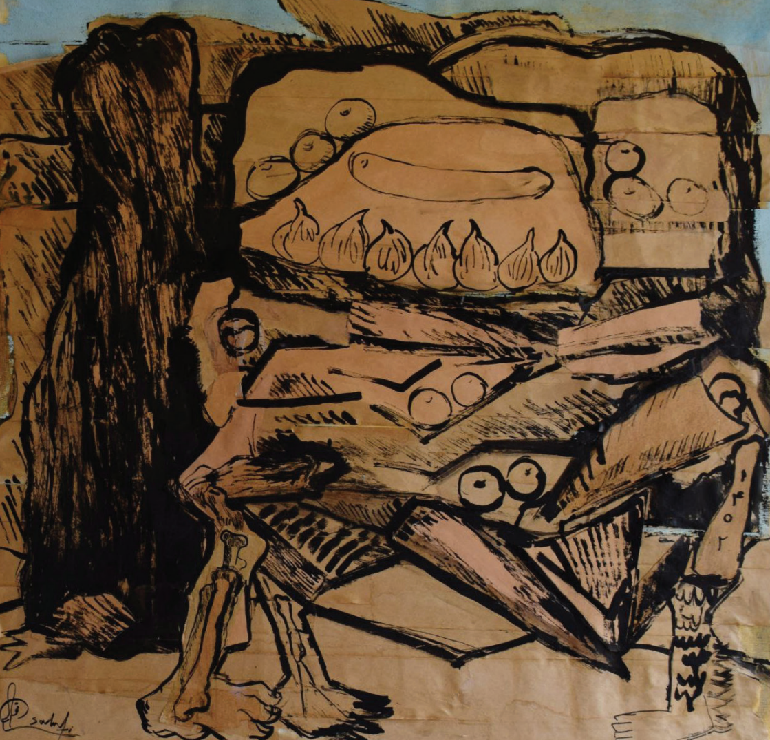
Untitled Mixed Media 60x60cm