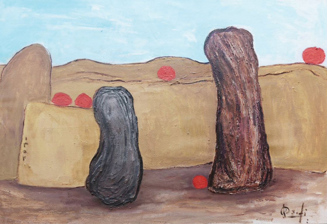
Untitled Oil Painting 100x70cm